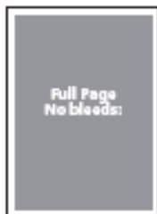
Full Page Ad